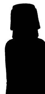
Hoa Hakananai'a 1000 - 1200

Created from over 2,000 pieces of turquoise attached to a wooden base. The two holes at the serpents' heads suggest it could have been worn on the chest. It was found in present-day Mexico.