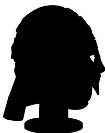
Sutton Hoo Helmet Late 6th century to early 7th century This ornate Anglo-Saxon helmet was found at a ship burial site. It is believed to have belonged to King Rædwald of East Anglia.